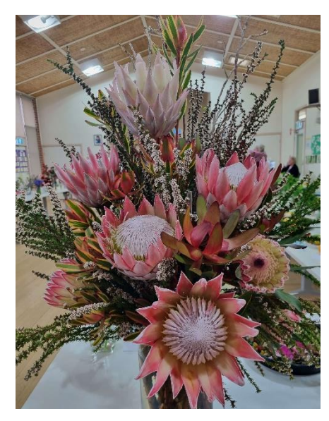
Our Spring Flower & Garden Show was a huge success